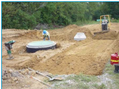
Wet wells and manholes are frequently upgraded during construction.

The project consists of upgrading approximately 2 miles of force main piping system that transport sewage from one pump station to a collector or another pump station. The project is primarily located north of Windcrest Avenue at Foster Road to the South of Comite Drive near Whispering Oaks. The section of the pipeline near Comite Drive was completed early to facilitate Comite Drive improvements.