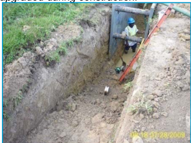
Trench boxes are used for pipeline installation.